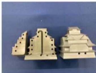
Molds and Machine Parts Using 3D Modeling and Surface Coating