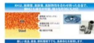
KH alloys that require no lubrication and offer excellent heat, wear, and corrosion resistance